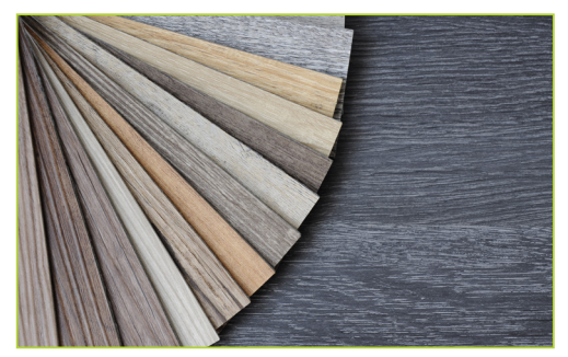
Laminated melamine papers, liners and HPL

MJB Wood Group, LLC www.mjbwood.com 972-401-0005